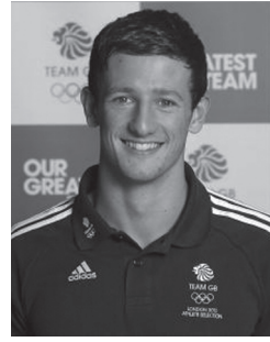
Michael Jamieson Swimming