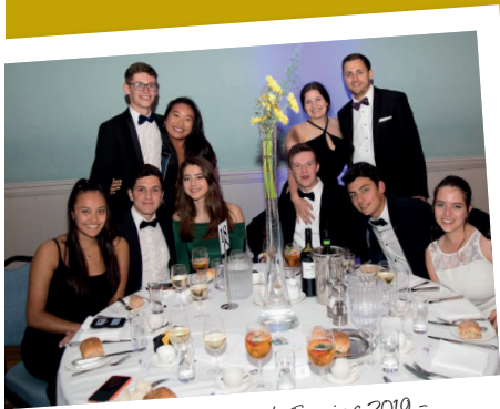
Blues Awards Evening 2019 - Assembly Rooms, Bath