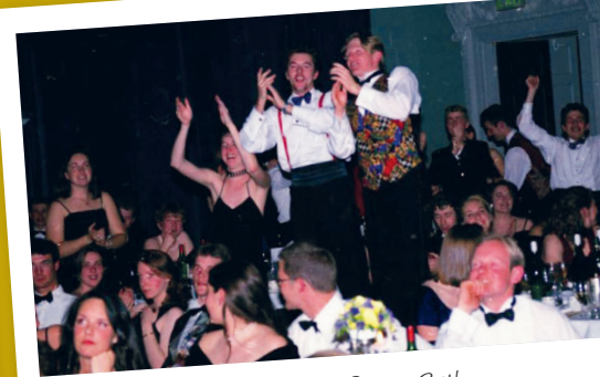
Blues 1995 - Assembly Rooms, Bath