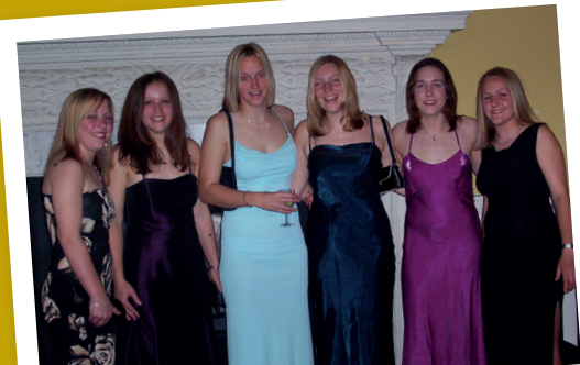
Blues 2004 - Women's Football 1st