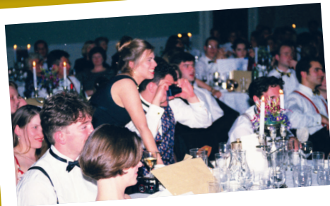
Blues 1994 - Assembly Rooms, Bath