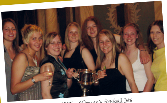
Blues 2005 - Women's football 1sts