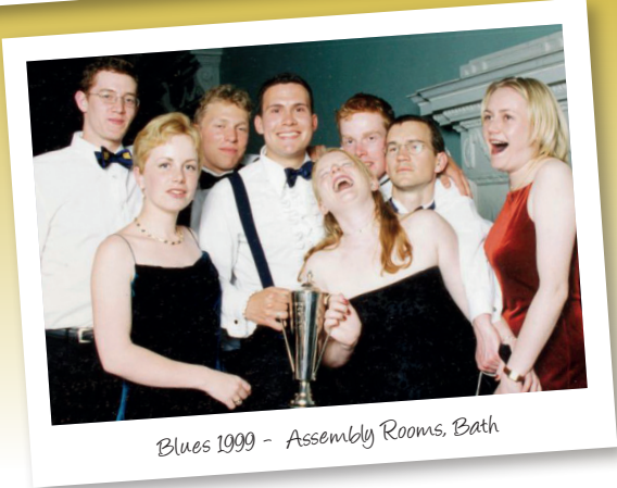
Blues 1999 - Assembly Rooms, Bath