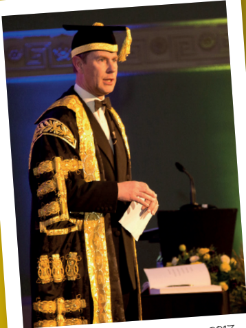
HRH Prince Edward - Blues 2017