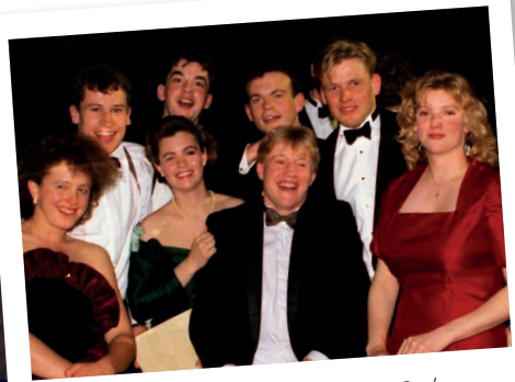
Blues 1992 - Assembly Rooms, Bath