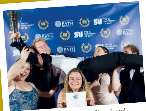
Sailing Club Club of the Year Award, Blues Awards Evening 2022 - Assembly Rooms, Bath