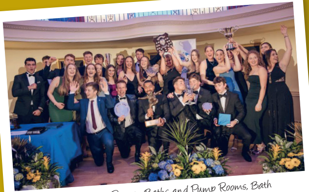
Blues 2023 - Roman Baths and Pump Rooms, Bath