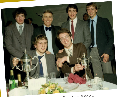
Blues Awards Evening 1983 - Assembly Rooms, Bath