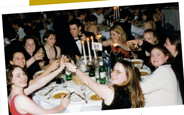
Blues 1998 - Assembly Rooms, Bath