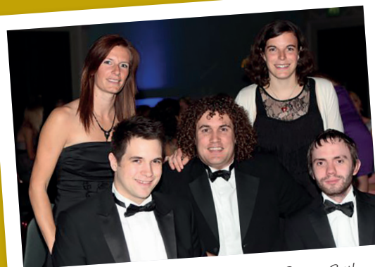
Blues Awards Evening 2011 - Assembly Rooms, Bath