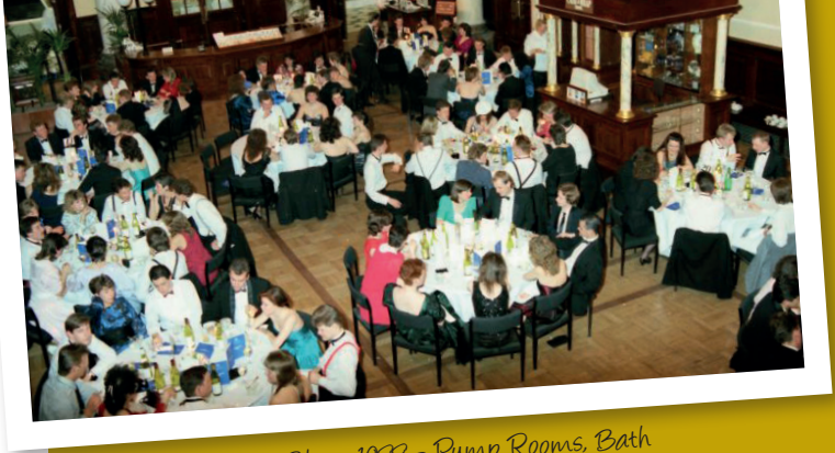
Blues 1988 - Pump Rooms, Bath