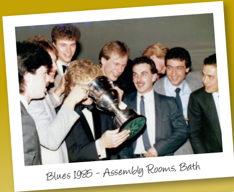
Blues 1985 - Assembly Rooms, Bath